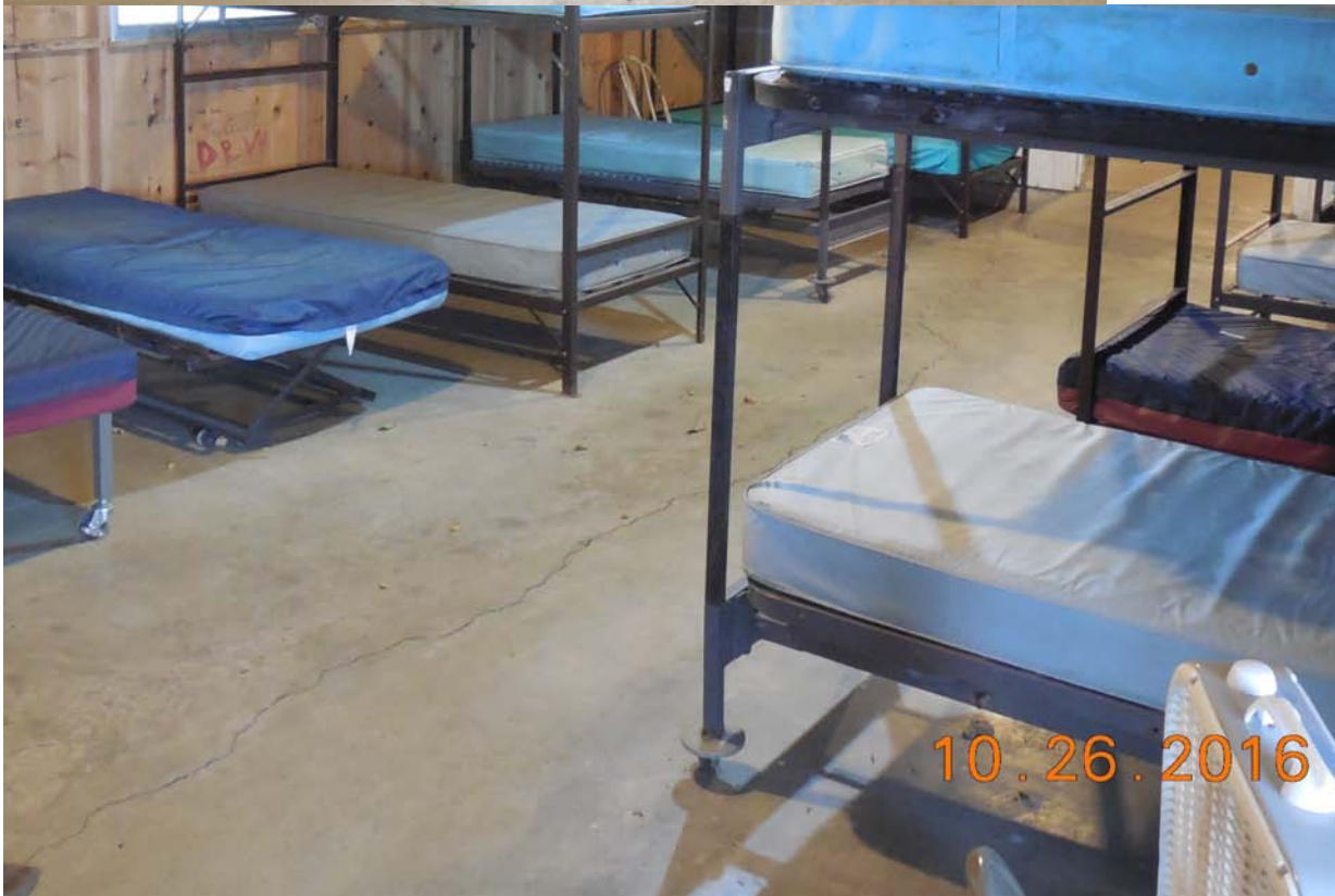
(Bottom picture in newer section of dorm)

The foundation is cracked in both sections of the dorm (the one built in 1963 and the one built in 1977).