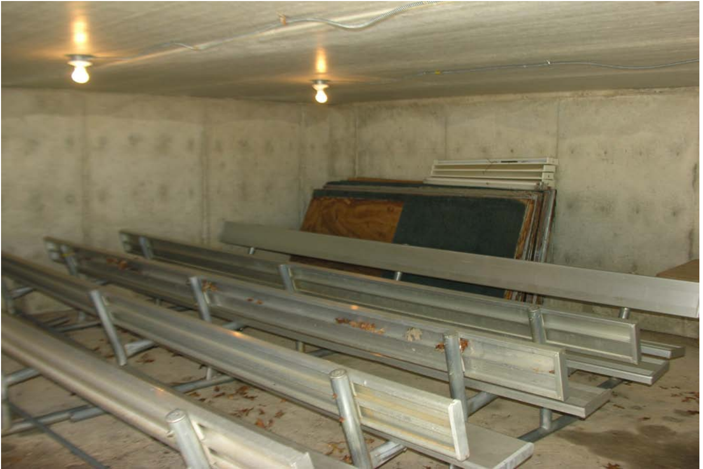
This is the inside of the current boys storm shelter. These are the benches from the campfire and they are stored in here. Otherwise, there are only wood benches to sit on. It has 4 lightbulbs in it. There is no bathroom.