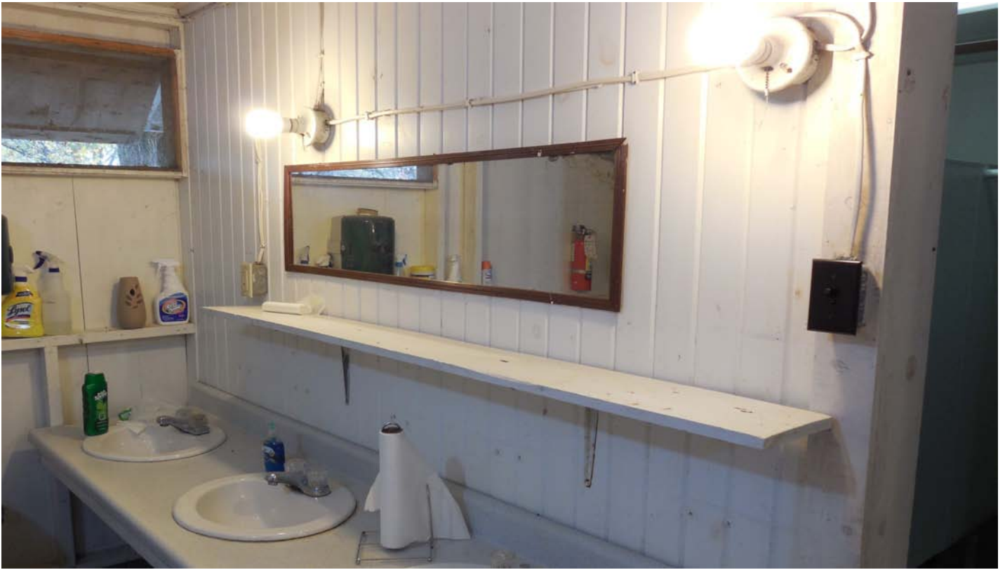
The sink area on the north side of bathroom. The shower stalls are particle board and they are deteriorating. Below is a fungus that has grown since camp ended.