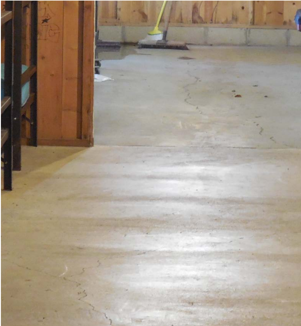
(Top picture viewed from old section of dorm looking into newer section.)

The foundation is cracked in both sections of the dorm (the one built in 1963 and the one built in 1977).